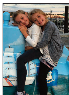
Thankfully, we have family in Connecticut, so I'll be able to see my girls a few times while I'm away.

I'm sure most of you have more traditional holiday plans, hopefully spending time with your own families, eating good food, relaxing, maybe even traveling a bit. Whatever your plans, I wish you a joyous and memorable holiday season!